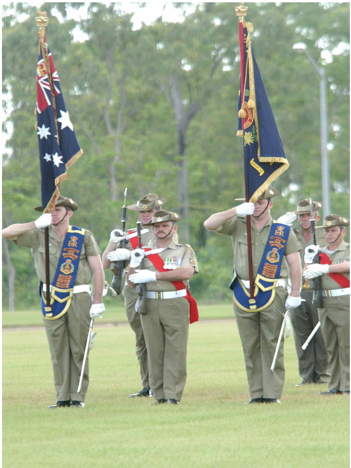
The New Colours during a General Salute.