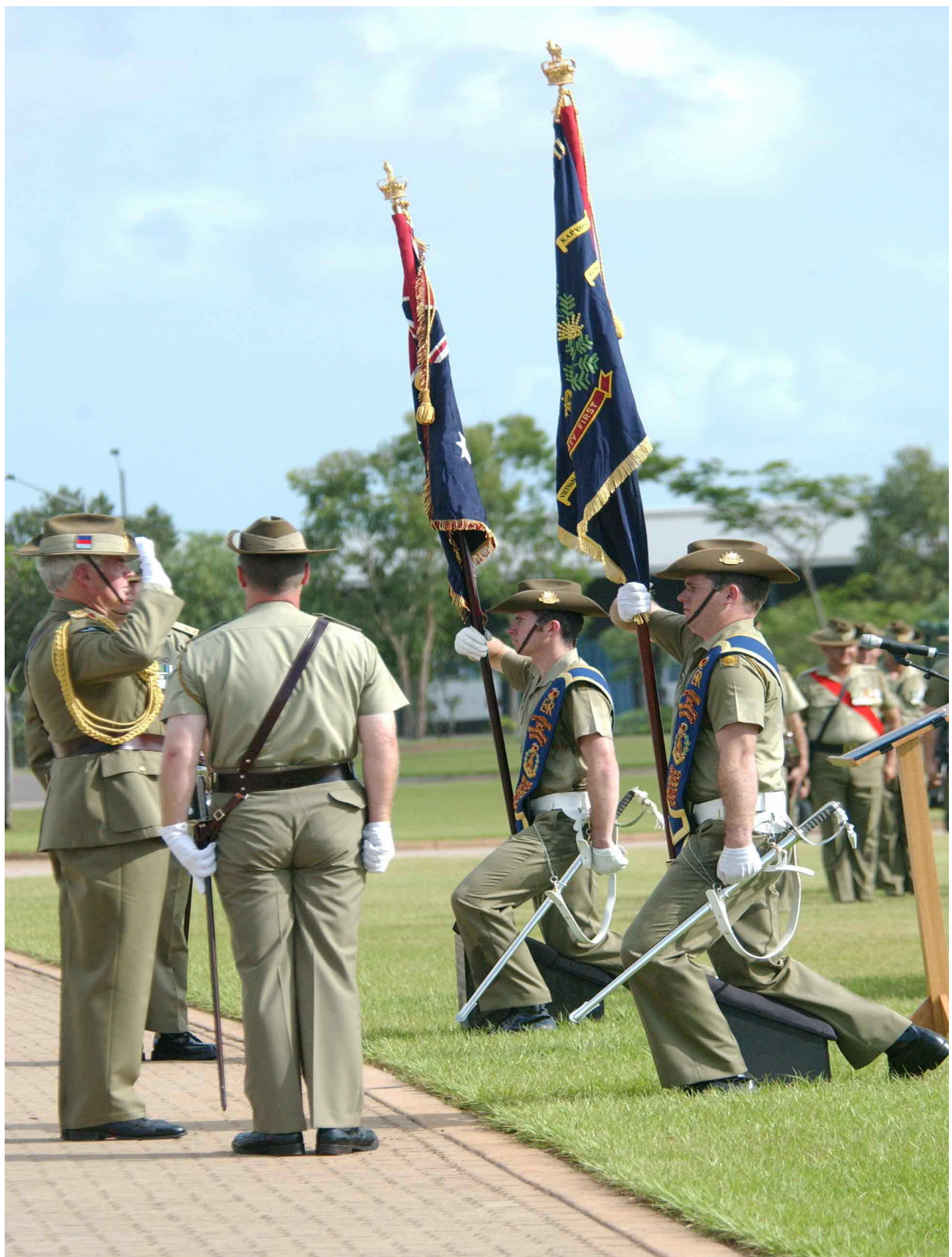
The New Colours of 5th/7th Battalion, Royal Australian Regiment (Mechanised).