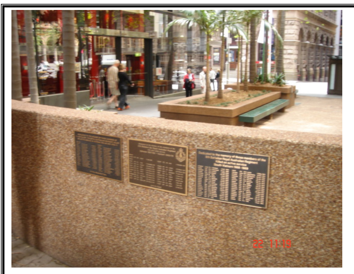
Above L to R: A view of the Honour Roll's of 7RAR, 8RAR and 9RAR.

Below: A view looking from the front of the Memorial at Regimental Square.