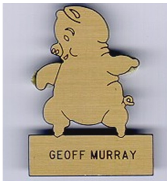
Ap- 9.0cm x 6.0cm