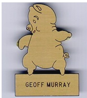
Approx. 6.0cm x 4.0cm

Geoff Murray email: geoffandlorraine@yahoo.com.au 30 Bouvardia Way Home: 08 9448 3109 GREENWOOD Mobile: 0432253043 WA 6024