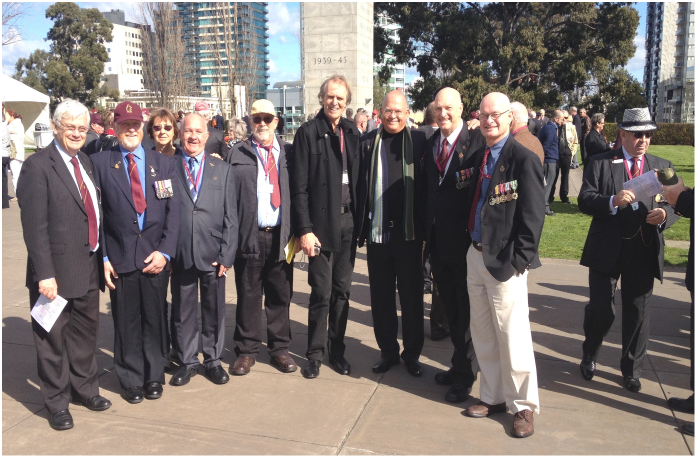
Above and Below:- Some of the happy crowd at the Shrine of Remembrance.