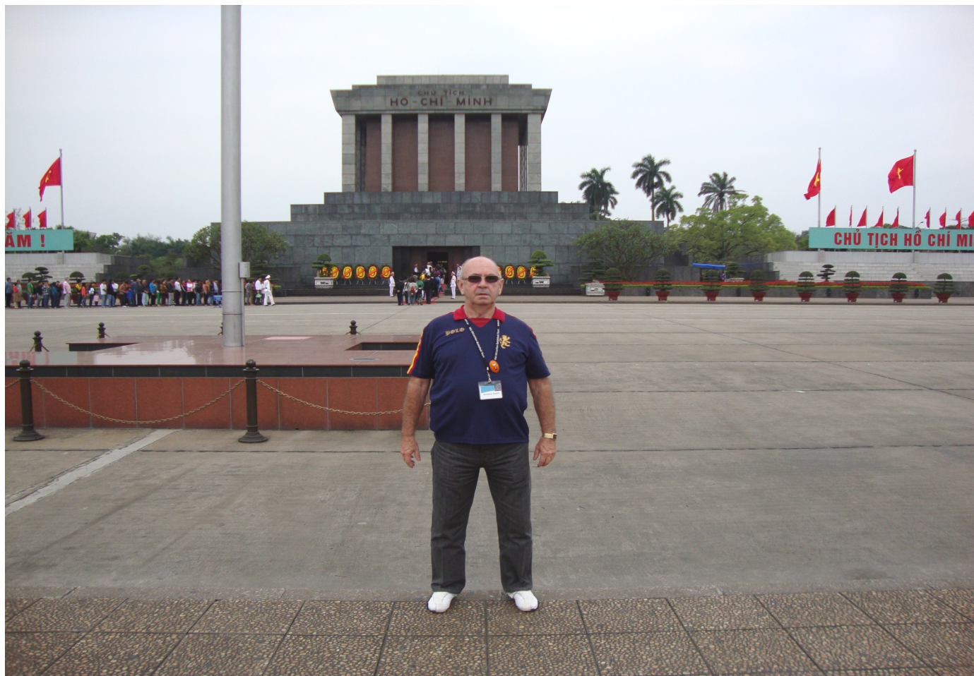
Below : Yours truly standing in front of the HO CHI MINH Mausoleum HA NOI.

Dress for the Memorial Service is suit with tie with medal. PM will be an ideal time for sub-unit get-togethers. Although sub-units may make their own arrangements, the following tentative arrangements have been made on your behalf after the Reunion Memorial Service:-