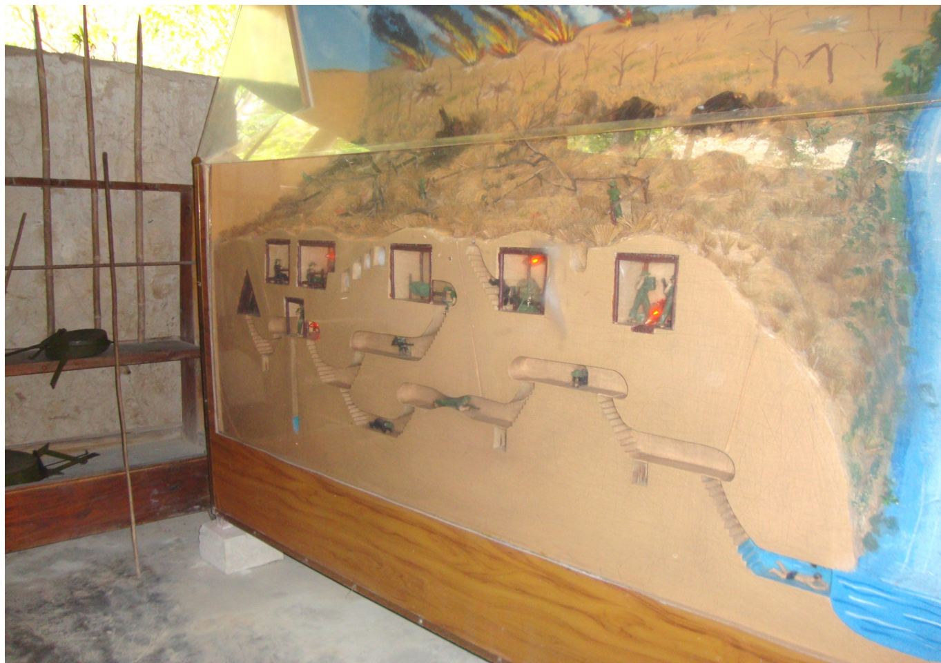
Above : A Cut-away frontal view of the Cu Chi Tunnels.