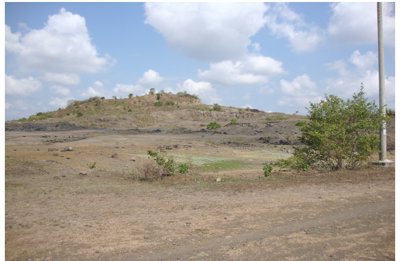
Above : NUI Dat hill looking from the East today, partly excavated for gravel. Below : A new primary school at the western end of Luscombe Airfield.

A group of 2 nd Tour digs have started a lunch tradition and all are welcome to join them at the RSL club in Perth, on the last Friday of each month. Good tucker and cheap beer prices, what's not to like?