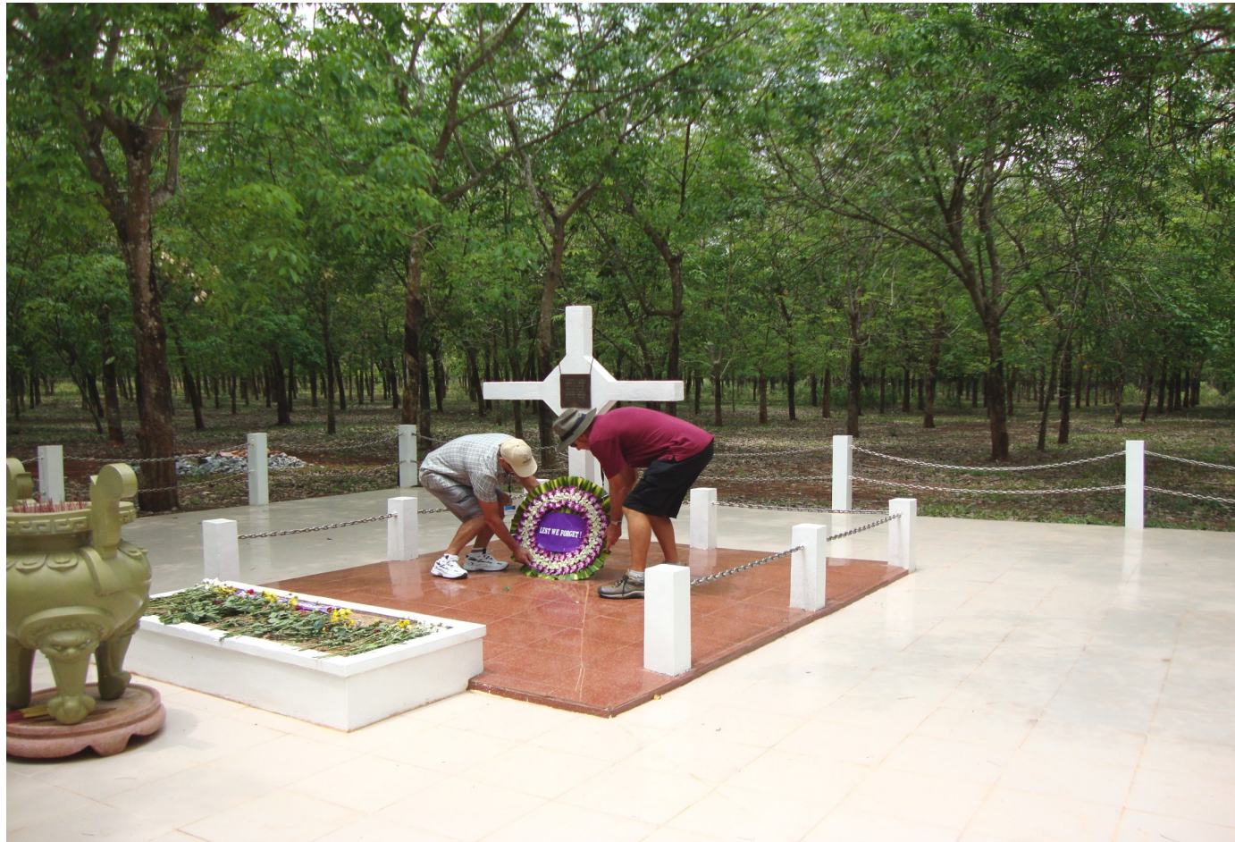
Above : Two of the touring party laying a wreath at the Long Tan Memorial. Below : A VC Memorial overlooking the area of the R & C Centre at Vung Tau.