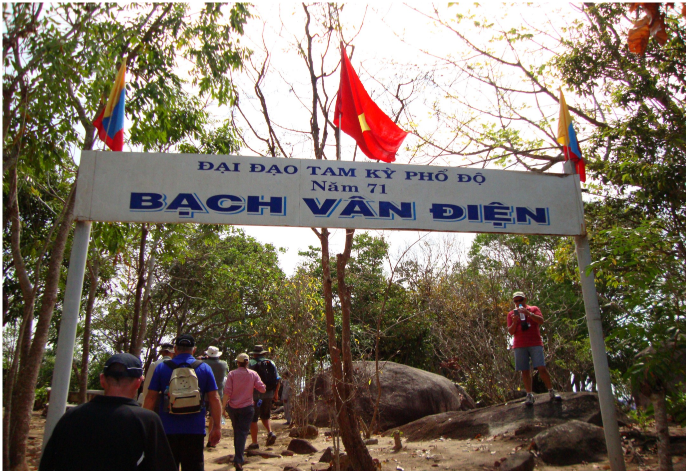
Above : Some of our tour group climbing to the top of the Long Hai’s. Below : Yours truly atop of the Long Hai’s with two Saigon Policemen.

Both these parks have offered a 10% discount when mentioning the 7RAR reunion.