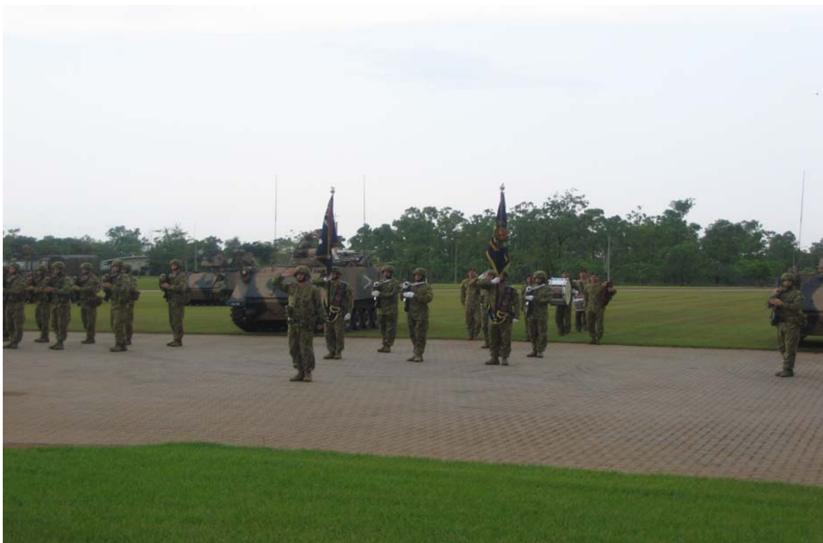
Above: 5/7RAR Colour Party on parade prior to unlinking.