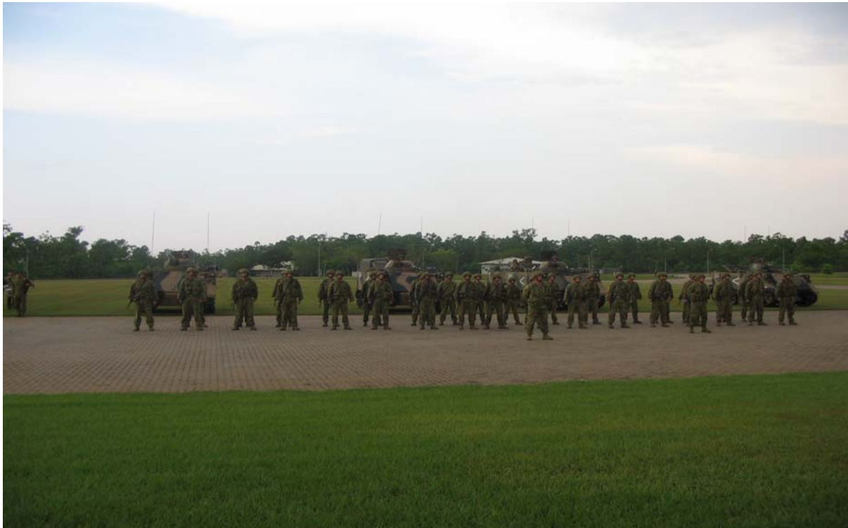
Above: 7 RAR Division on parade.